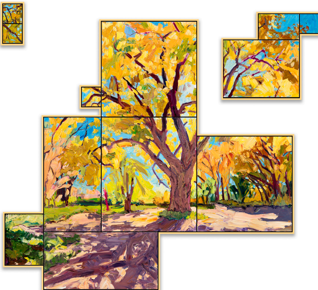
Jivan Lee, The Blessing Tree , Oil on twelve panels, 100 x 100 inches